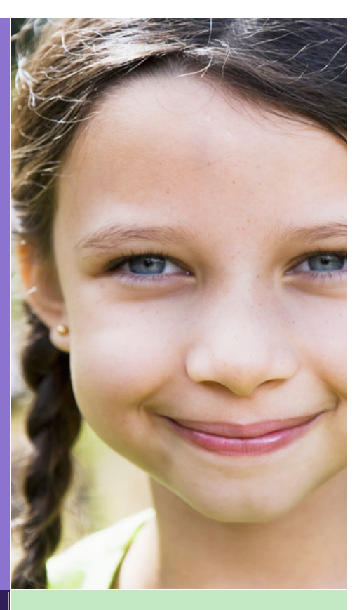
2015 by Girl Museum. Inc.

Learn more and get involved at www. Girl Museum.org