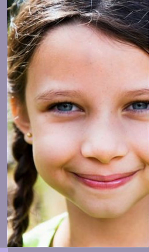
© 2017 by Girl Museum, Inc.

Learn more and get involved at www.GirlMuseum.org