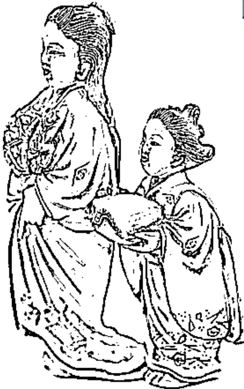
Netsuke of Geisha and attendant End of 1700s The Metropolitan Museum of Art