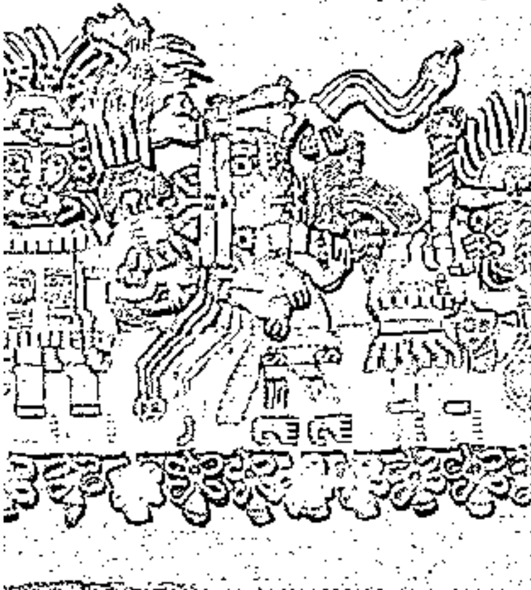
The Paracas Textile 100-300 CE Brooklyn Museum