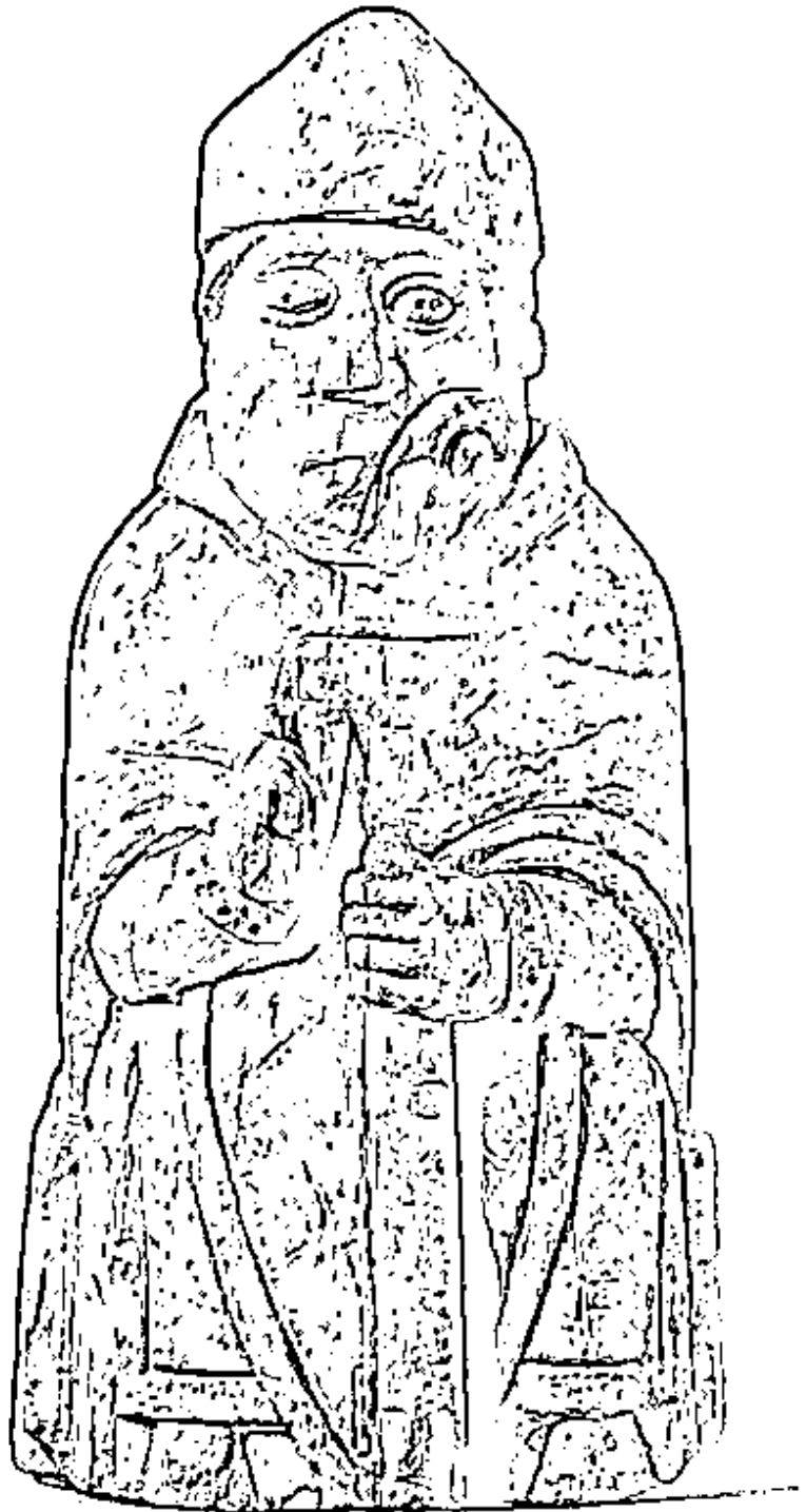
The Lewis Chessman 1150-1175 CE The British Museum