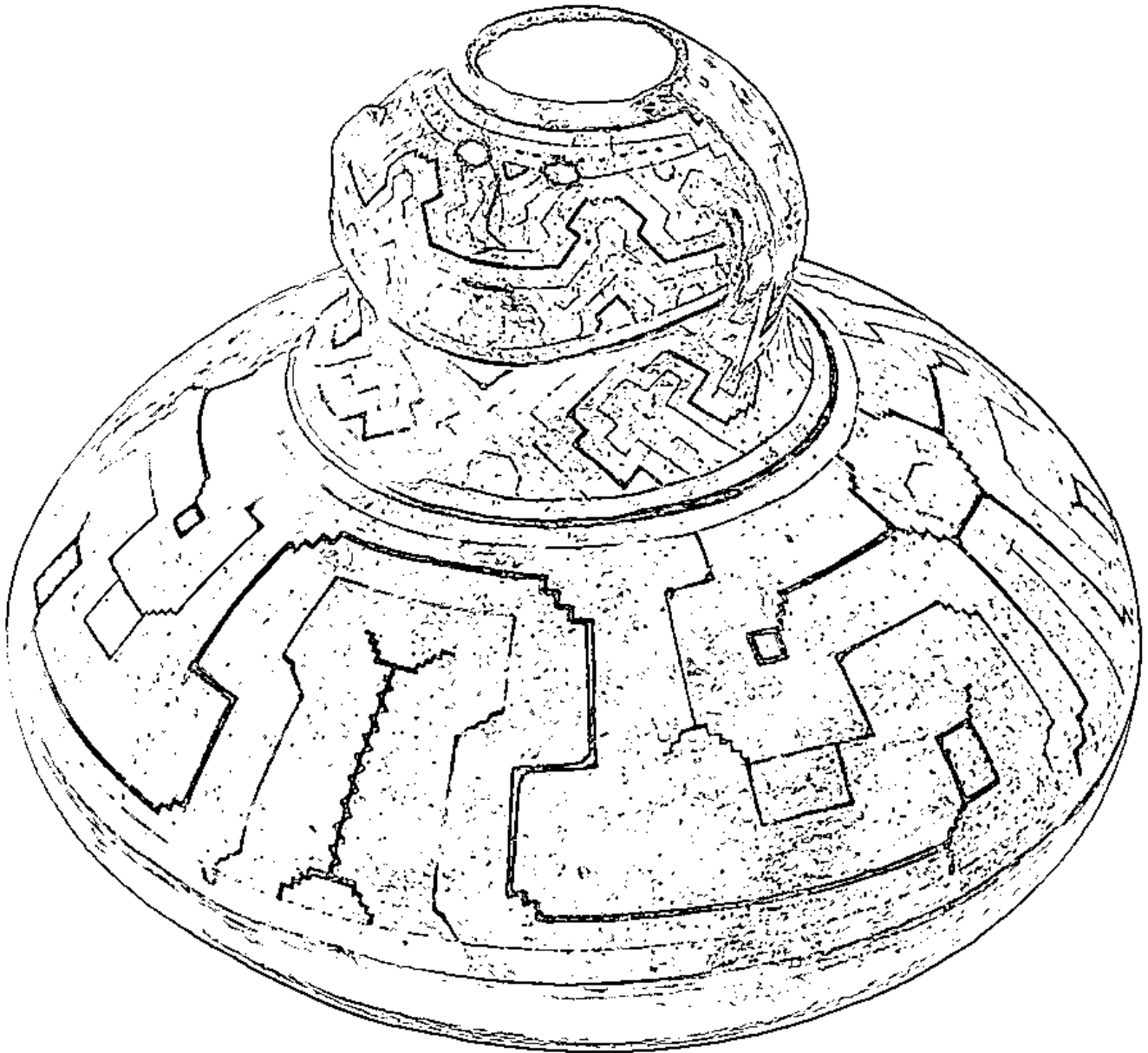
Shipibo ainbo chomo